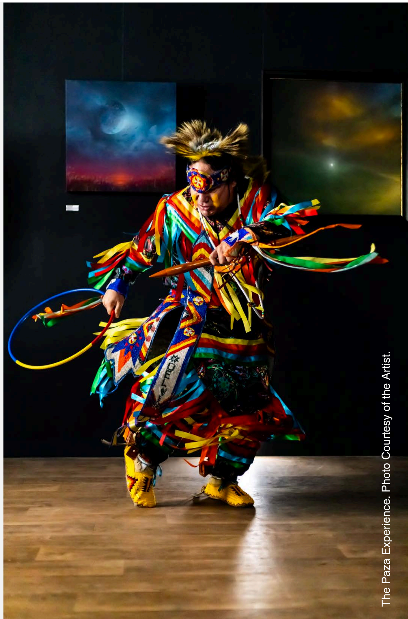
The Paza Experience.